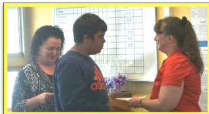
Academic Achievement Gold Award