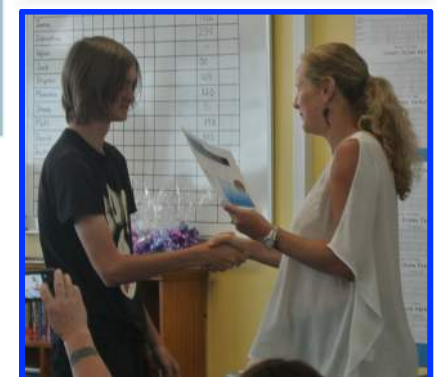
Class Achievement Award Year 9