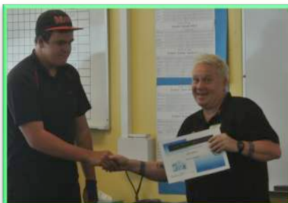
All Rounder Award