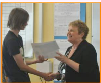
Quiet Achiever Award