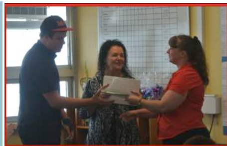
Karabar Distance Education Academic Achievement Award