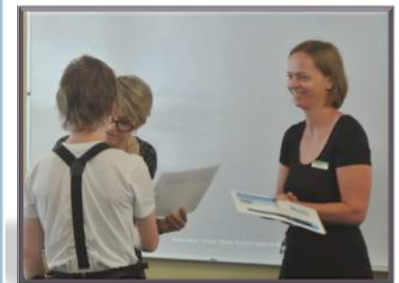
Class Achievement Award Year 8