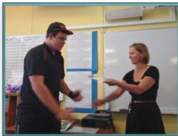
Class Achievement Award Year 10