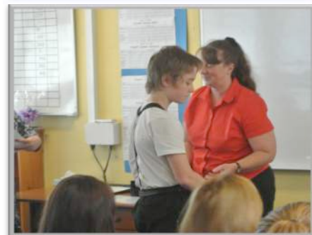
Karabar Distance Education Academic Achievement Award