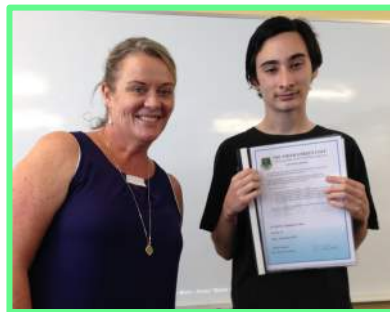
Graduation to Post School program