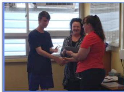
Karabar Distance Education Academic Achievement Award