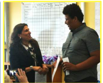
Class Achievement Award Year 7