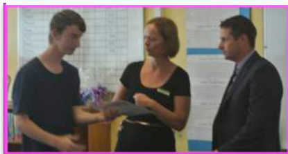
Excellent School Attendance Award